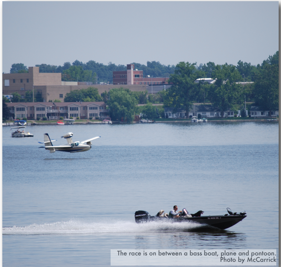
The race is on between a bass boat, plane and pontoon.