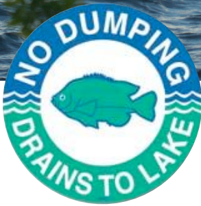
Example of a "NO DUMPING" Decal being placed on area storm drains