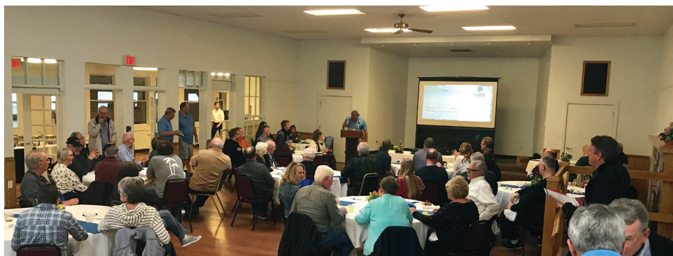
WLPA annual meeting 2018